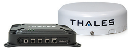
Thales MissionLINK RRP: $13,225 inc. GST ($11,500 ex GST)